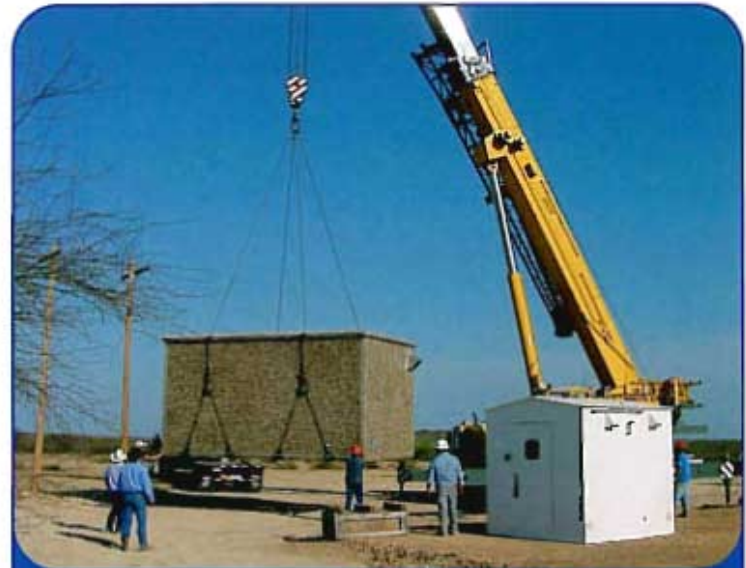
Complete Turnkey 12'x20'x10' Chemical Control Building. Buildings up to 14'x24' can be shipped fully assembled. All electrical and hardware for your process can be preinstalled in a concrete building ready for your jobsite.