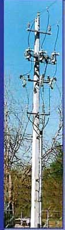
Sports Lighting Pole