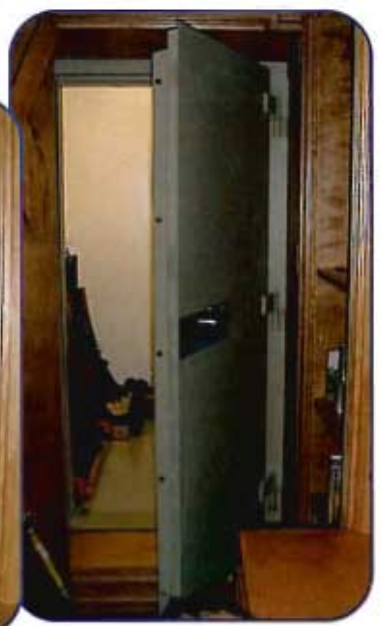
Fire rated tornado vault installed on house slab prior to construction.