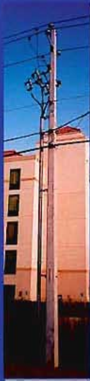
Line Rehabilitation - Wood Pole Replacement