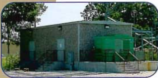
20' x 40' multi-user communication building.