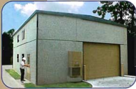
30' x 40' x 16' Pre - engineered operations building.