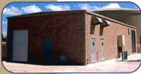
30' x 70' Pump Station.