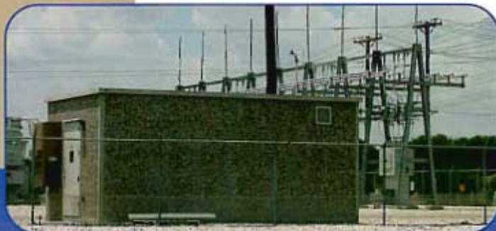
14' x 24' x 10' sub station control building.